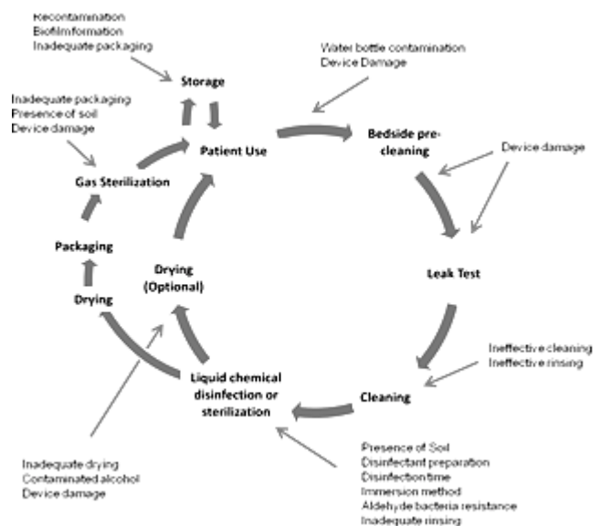
Fig. 1. Reprocessing cycle of duodenoscopes. Breaches and threats for gold standard reprocessing protocols are shown with exterior arrows, as illustrated by Humphries et al, 2015 [7]

Endoscope reprocessing means some conjunct methods applied in order to minimize the bioburden of various endoscopes after each use. First, each device should be cleaned manually after each use at bedside for residual soil. Afterwards the endoscope is run through several tests that would detect leakages or damages of the device after usage. Subsequently each endoscope is chemically cleaned after manual cleaning, this second cleaning process being tributary to chemical detergents. Only afterwards is the device ready for HDL or sterilization. Both HDL and sterilization are achieved by immersion of the medical device in the liquid chemical agent or by gas exposure (e.g. is case of ethylene-oxide sterilization). Finally the device is ready for another usage or for storage. Such reprocessing cycle alongside with its weak points and threats is shown in figure 1, as it is very eloquently illustrated by Humphries et al in a recent paper on duodenoscope reprocessing [7].